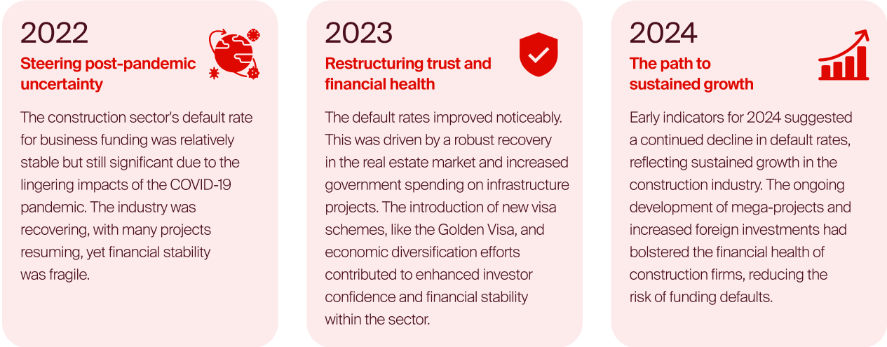
Figure 1: Comparison of the default rates and market growth rates in the UAE construction industry from 2022 to 2024:

The construction and contracting industry in the UAE is experiencing a remarkable recovery, growth, and resilience journey. In recent years, the sector has successfully navigated challenges brought on by the COVID-19 pandemic while steadily laying a stronger foundation for the future. With declining default rates, increasing market confidence, and a surge in local and foreign investments, the industry is on the rise. The following section will examine the breakdown of funding default rates from 2022 to 2024.